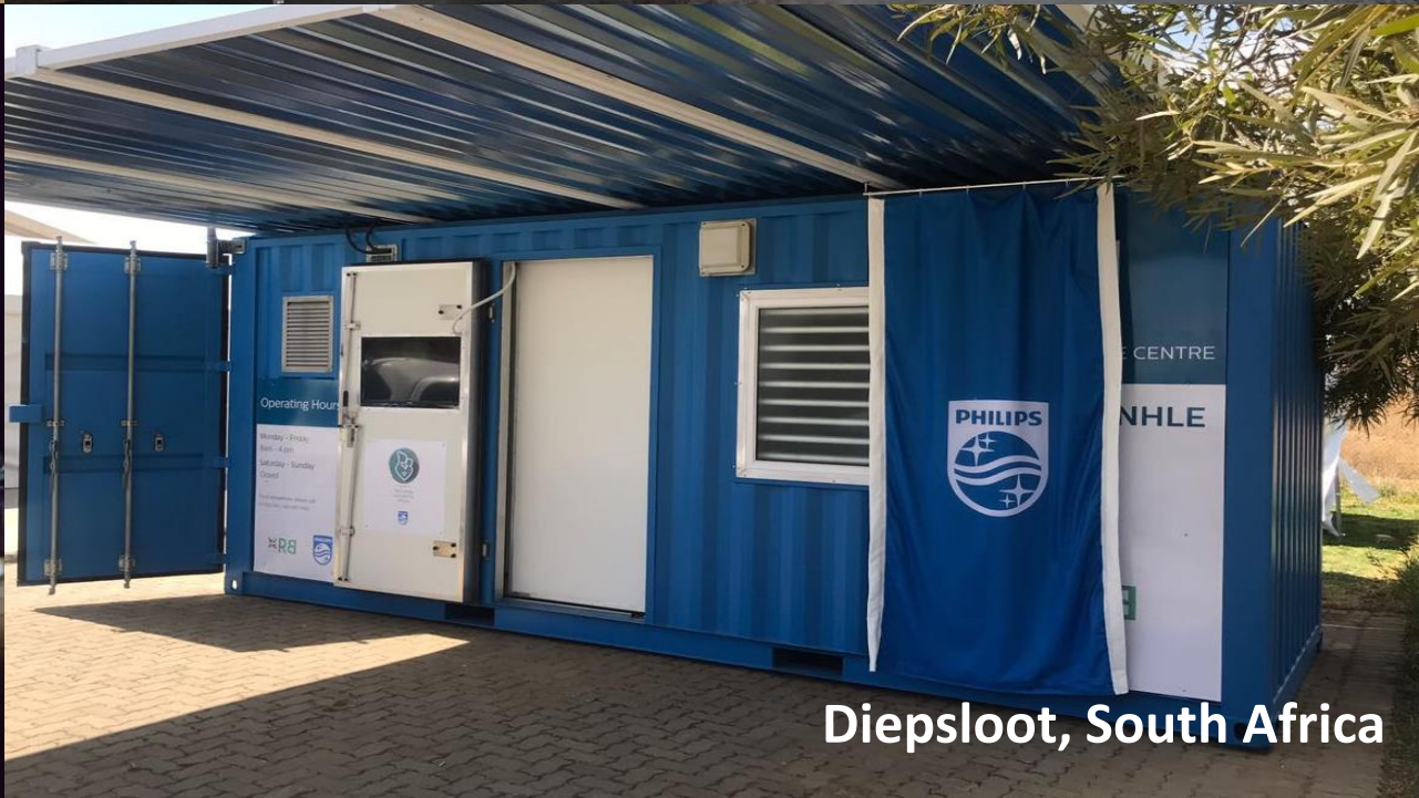
Diepsloot, South Africa